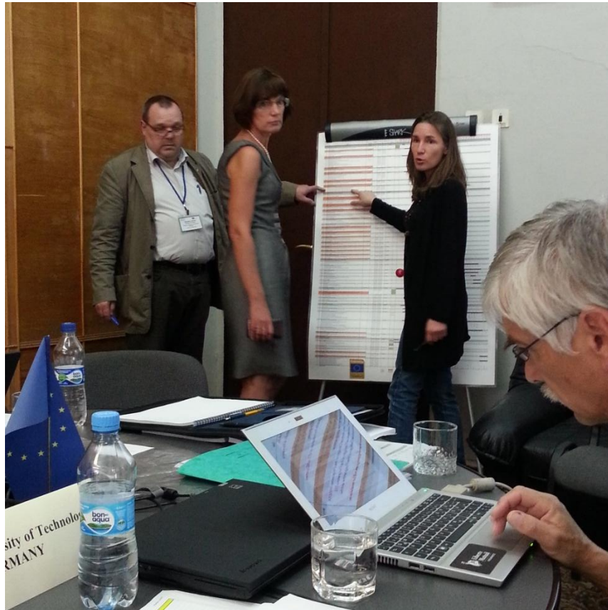
Working on the Activity Delivery Plan

Periodic meetings are scheduled to review the current situation and discuss forthcoming activities. The second such a meeting was hosted by NTU “KhPI” from June 5 to June 8. During the meeting sessions, the partner institutions presented the work done and the work package leaders reported about actual statuses of their packages. Also, the selection of the Remote Lab technologies was finalized by AM/GE/UA partners. These discussions were reflected in the final revision of the iCo-op Activity Delivery Plan.