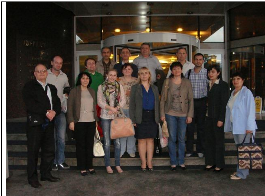
Group photo of Brasov training participants